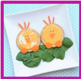
Cheese & Cracker Chicks

https://canadianfamily.ca/food/cute-snack-idea-cheese-and-cracker-chicks/