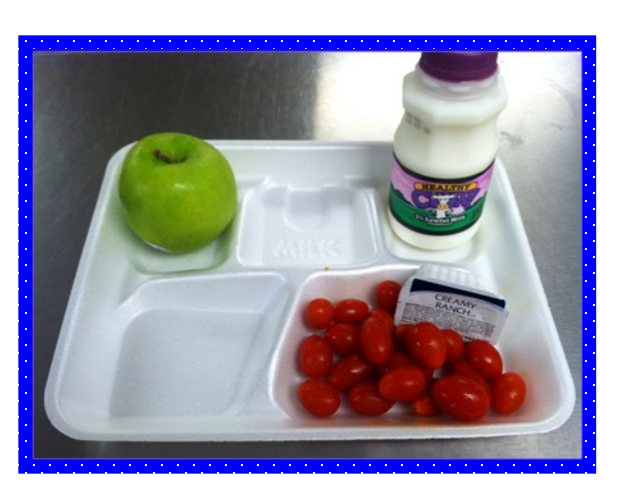
I. Fruit 2. Vegetable 3. Milk