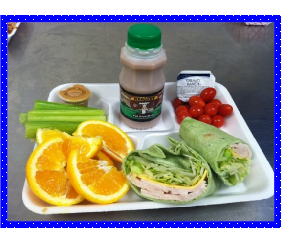
I. Meat/Meat Alternate 2. Grain3. Fruit 4. Vegetable 5. Milk

All of these are considered a reimbursable lunch!