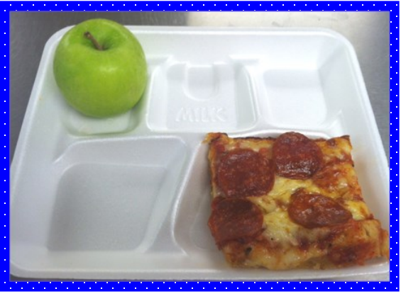
Meat /Meat Alternate 2. Grain Fruit