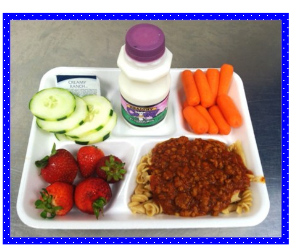
Meat/Meat Alternate 2. Grain Fruit 4. Vegetable 5. Milk

A student needs 3 out of 5 components in order for a meal to be reimbursable. I of these 3 components must be a fruit or vegetable.