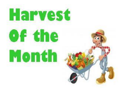
Network for a Healthy Delaware

The Harvest of the Month featured vegetable is Asparagus!